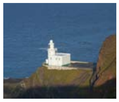
Hartland Point lighthouse

At the next stile ignore the path inland to Exmansworthy and from the stile bear right along the righthand edge of this field.